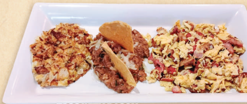
EGGS WITH BACON

8 oz catfish and (3) breaded jumbo shrimp. Served with lettuce, sliced avocado, orange wedges, croutons, rice and fries. .... 18.95