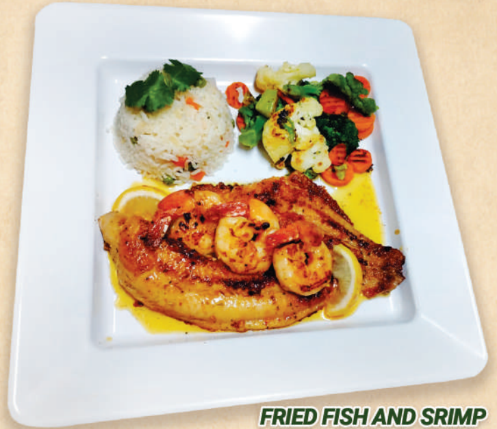
FRIED FISH AND SHRIMP

Fajita steak, tilapia fillet, and (3) breaded shrimp. Served with rice, veggies and French fries. .... 23.99