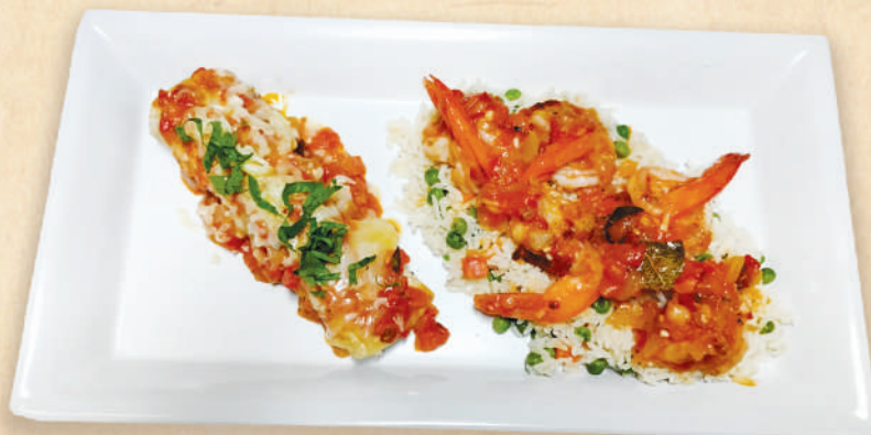
THE LONE STAR PLATE